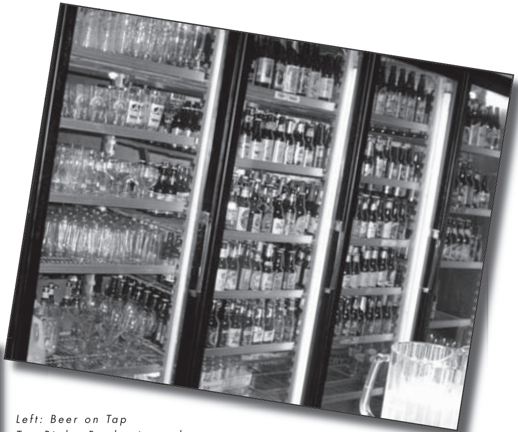
Left: Beer on Tap Top Right: Bottles in cooler

The CT Lounge will be the place to hang out this summer. Stop in and cool down with a beer and great atmosphere.