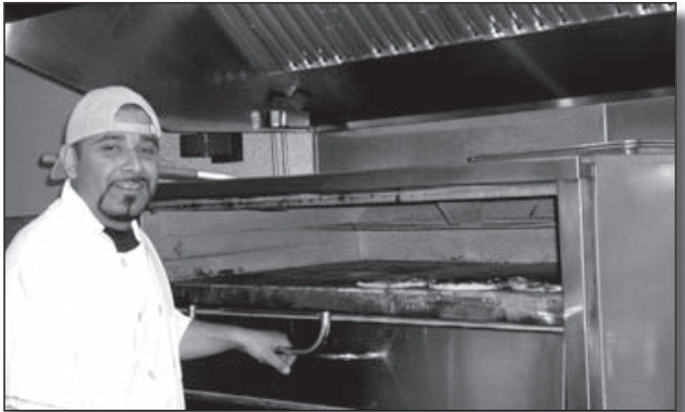
Cook and overview into pizza oven