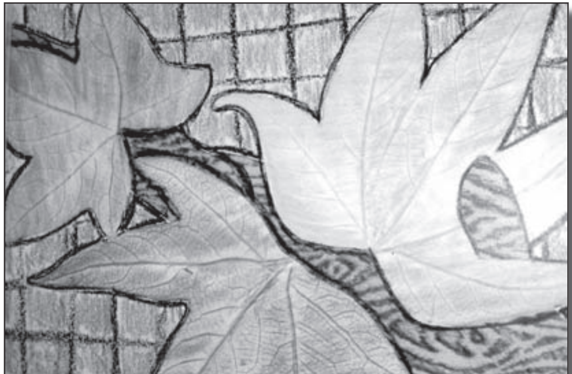
One of many artists submissions.